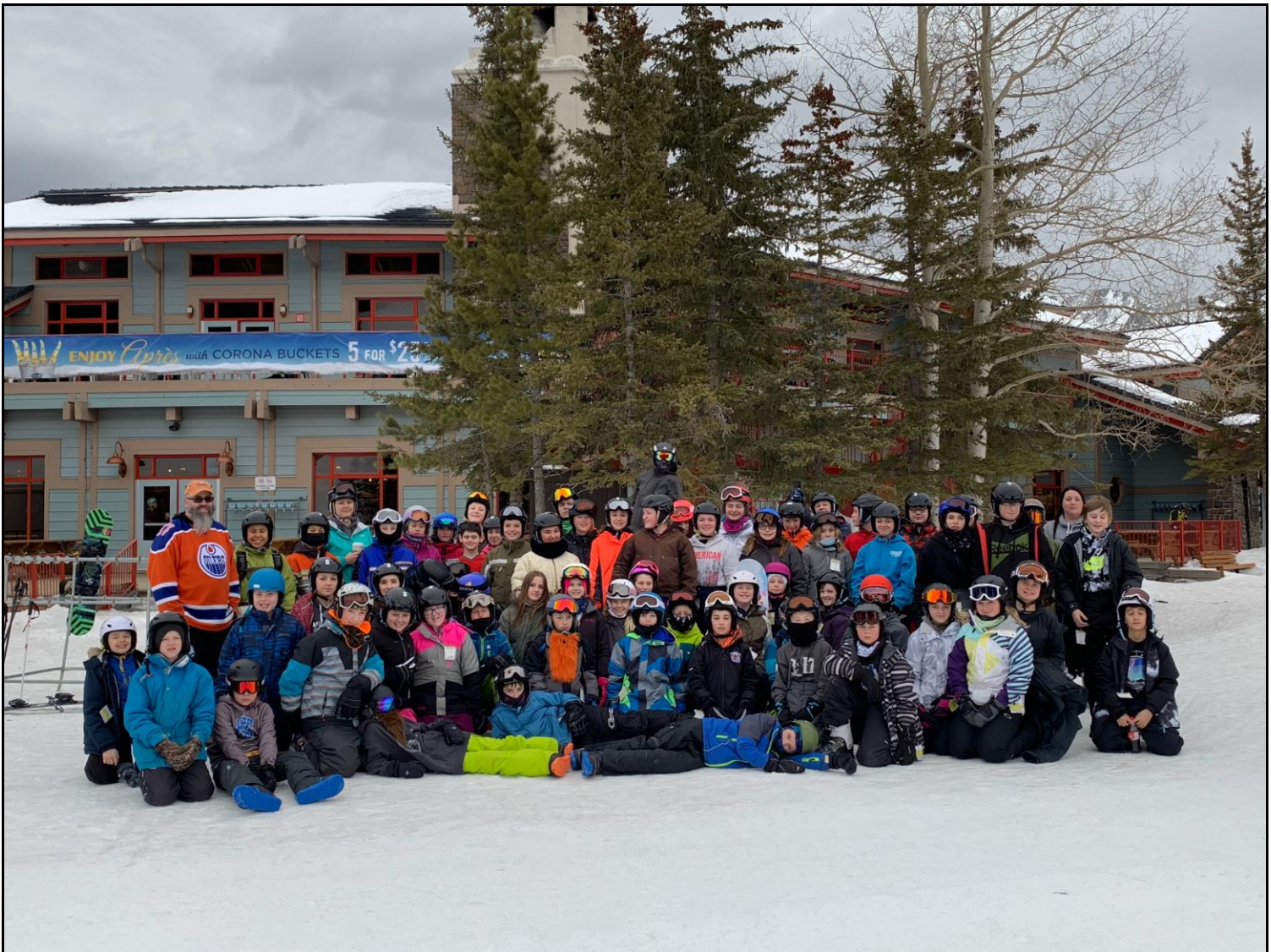
Middle School Ski/Snowboard Day March 12, 2019 Nakiska Ski Resort, Kananaskis, Alberta