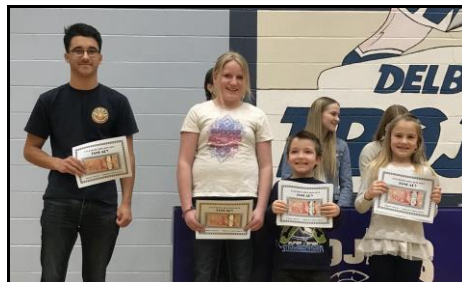
(DCS Award recipient names were entered into a draw).