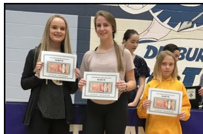
(DCS Award recipient names were entered into a draw).