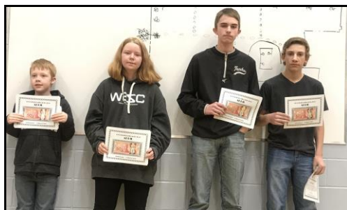
(DCS Award recipient names were entered into a draw).