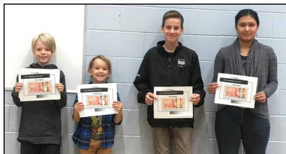
(DCS Award recipient names were entered into a draw).