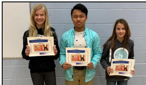
(DCS Award recipient names were entered into a draw).