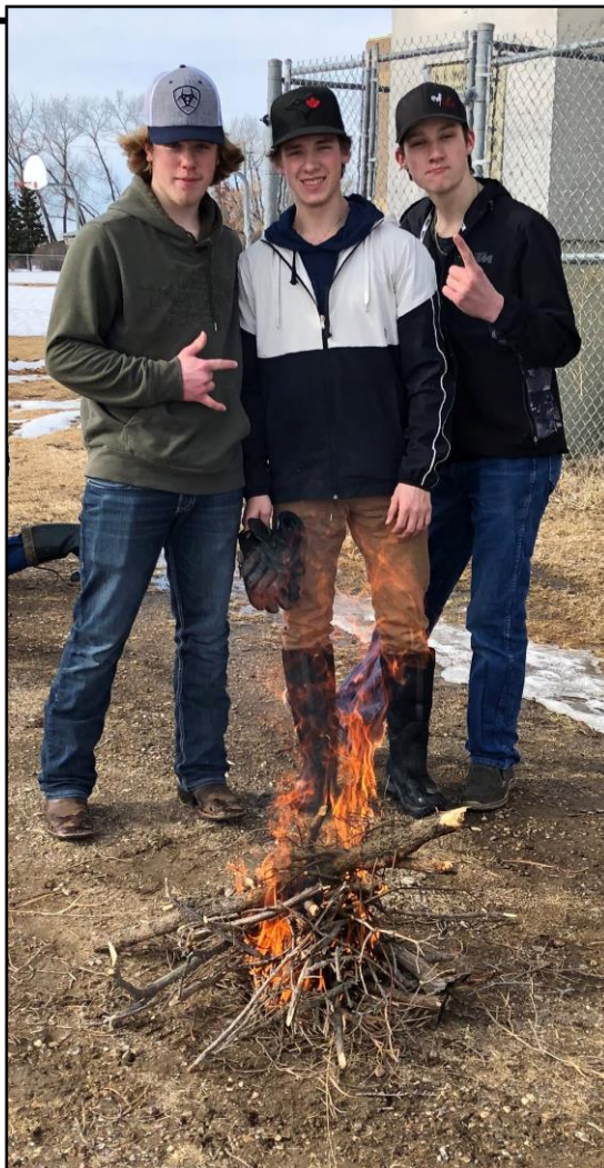
Phys Ed 20 Survival Fire Making session.

School Phone: 403-749-3838 School Fax: 403-749-3012 Website: www.delburneschool.ca School Begins at 8:40am, ends 3:05pm Lunch from 12:00am-12:40pm